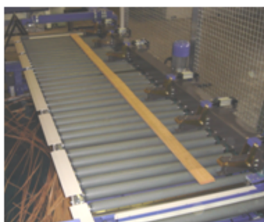
BACK UNLOADING UNIT

- THE GUILLOTINE TRM-2L EXPRESSES THE STRONG POINT OF OUR RANGE. IT HAS BEEN SOLD IN ALL THE WORLD IN MORE THAN 1000 UNITS, IT HAS GIVEN TO OUR COMPANY BIG SATISFACTIONS, IT ALLOWED US TO ACHIEVE GREAT THINGS AND TO BECOME ONE OF THE LEADING COMPANY IN THE SECTOR.