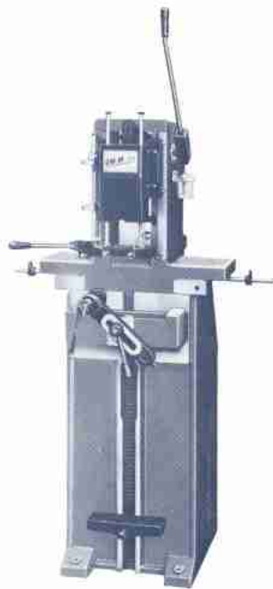
Art. 2207 Universal chain mortiser - Mod. "OMM.250"