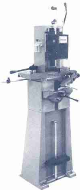
Art. 2208 Universal chain mortiser - Mod. "OM MINOR"