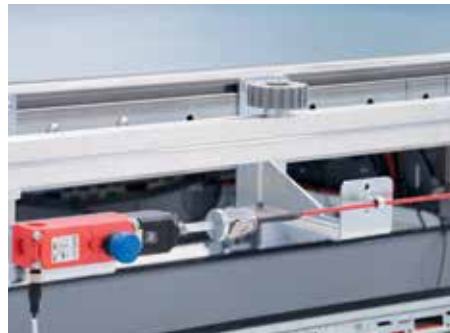
Equipment to achieve CE-conformity: rip cord back to the return belt