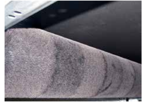
Belt cleaning equipment (option)