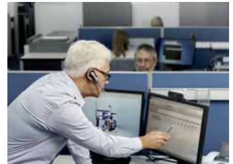
Remote Service: Excellent machine availability thanks to shorter periods of idle time and therefore lower production costs.