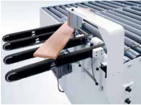
Turning bolt for narrow parts, sensor controlled (optional)