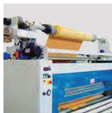
Option upper unwinding station. Desbobinador superior opcional.