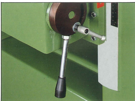
QUICK ADJUSTMENT equipment for adjusting table rolls while encountering with unusual rough bottom workpiece.