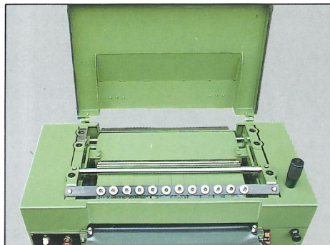
ACCURATELY designed with well built, neat, and precise structure.

* All specifications, dimensions and design characteristics shown in this catalogue are subject to change without notice.