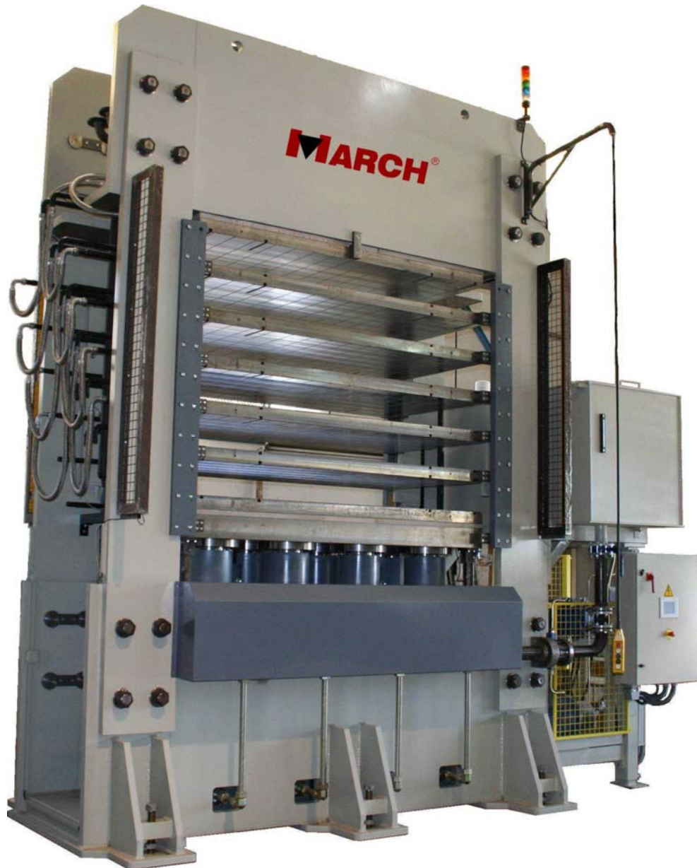
MODEL PHE 2311-6

Hydraulic press for embossing of fiberboard for doors by molds.