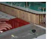
ROBA Duplex for edge processing of furniture doors