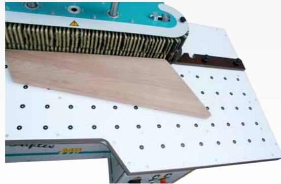
ROBA Duplex for edge processing of wooden steps