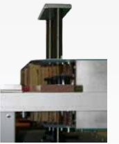
ROBA Duplex aggregate side view: 30 mm oscillation and pneumatic height adjustment to change sanding area

If there is a need to sand long work pieces as e.g. table tops, MB offers the new ROBA Duplex XL. This machine has a work range of 1900mm in combination with all other options the standard Duplex offers.