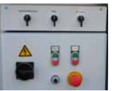
Simple operation of all control elements