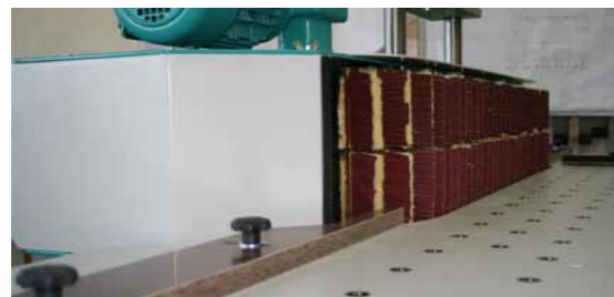
Two sanding areas

The ROBA Duplex is famous for its simple operation and optimal results. Processing times are considerably shortened.