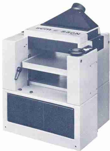
Art. 2174 Thickening planer - Mod. "S50N"