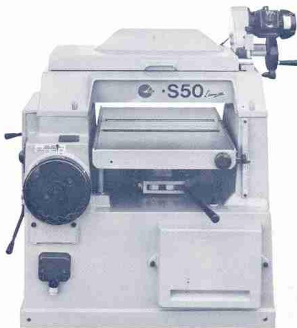
Art. 2175 Thicknessers - Mod. "S50"